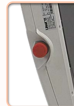
Emergency stop button