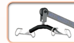
Secured 4-point spreader bar