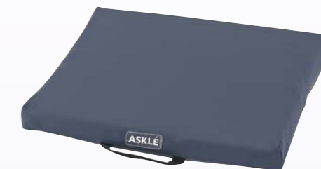
For homecare use: delivered with 2 covers For nursing homes use: delivered with 1 cover